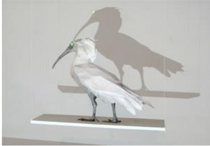
Nipponia Nippon 2009 Sculpture and Video installation