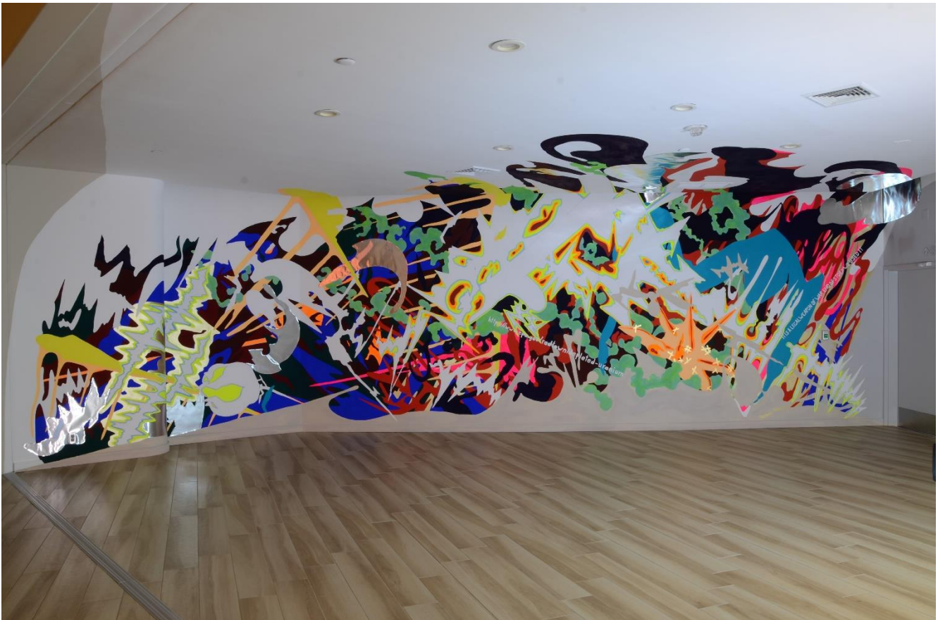
Image: Claudia Chaseling, mutopia 2 , 2019, Gold leaf, aluminum, pigments and MDM binder on wall and ceiling. Collection of 310W.